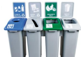
EASY TO SET UP AS A COLLECTION STATION