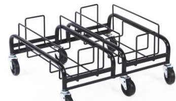
OPTIONAL WHEEL DOLLY