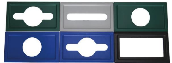
VARIETY OF LID OPENINGS & STAMPING OPTIONS