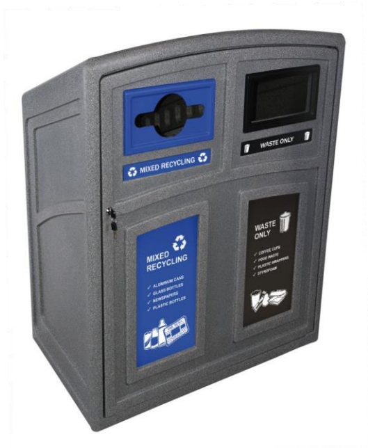
Optional labels available