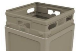
Grab Bag System

Enhance the image of any location with StoneTec Waste containers. A clean and attractive way to promote recycling in all environments including; shopping malls, offices, hotels, corporate facilities, universities, restaurants, convenience stores, and more!