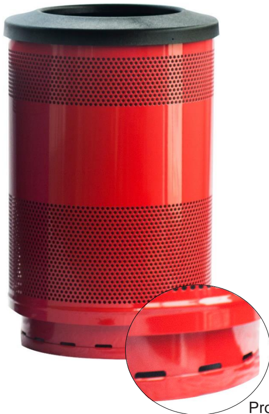
Protective Coated Base