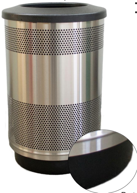
Protective Coated Base