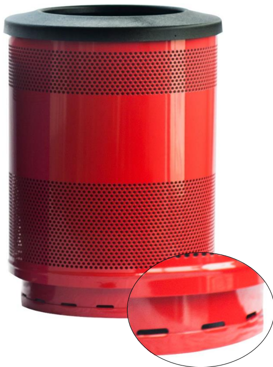
Protective Coated Base