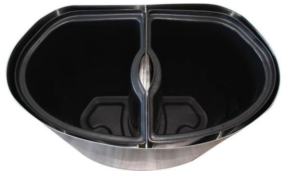
2 LINERS ENSURE A CLEAN SORT