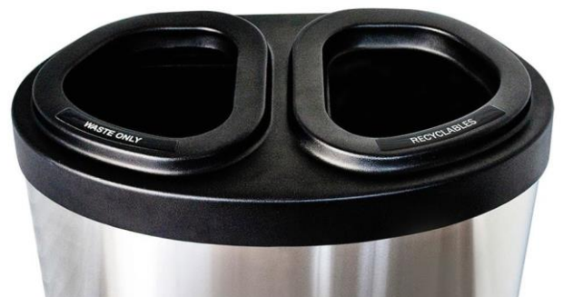
LABELS MAKE IT CLEAR