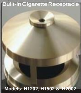
Models: H1202, H1502 & H2002