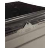
Patented Grab Bag™