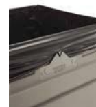
Patented Grab Bag™