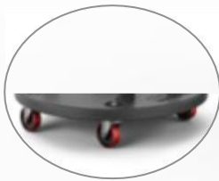
Optional dolly friction fits for easy removal (fits all sizes)