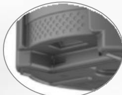
Easy grab base handles allow for effortless handling