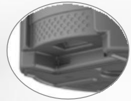
Easy grab base handles allow for effortless handling