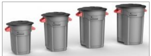
Available in 20, 32, 44, 55 gallon sizes.