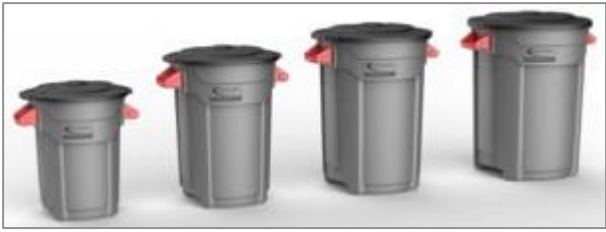
Available in 20, 32, 44, 55 gallon sizes.